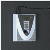
Biometric access control system