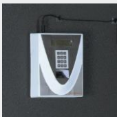
Biometric access control system